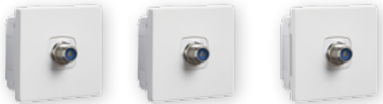
CMM910FFWE CMM920FFRWE CMM920FFLWE