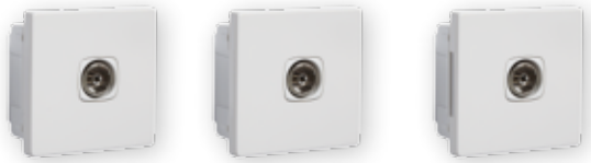
CMM910PWE CMM920PRWE CMM920PLWE

CAT NO. CMM910PWE, CMM920PRWE, CMM920PLWE, CMM910FFWE, CMM920FFRWE, CMM920FFLWE