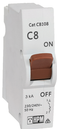
CDCB108 Available in Australia