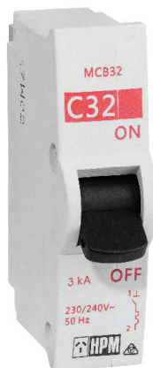
CDCB132 Available in New Zealand