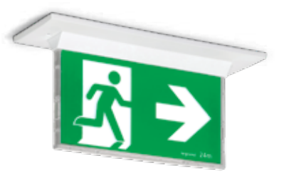
CAT. NO. 659624LI