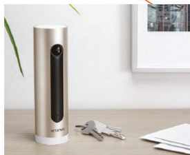
NETATMO Smart Indoor Camera