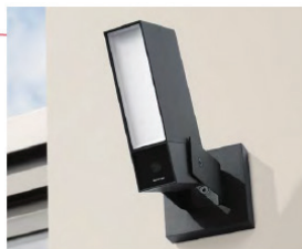
NETATMO Smart Outdoor Camera