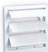
A800: 100mm external shutter with gravity flap to protect against backdraft