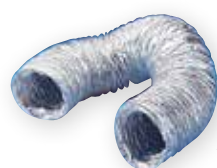
A100: 3m x 100mm diameter ducting