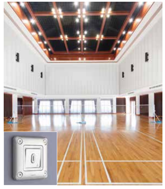
SPORTS FACILITIES | Illuminated pushbutton