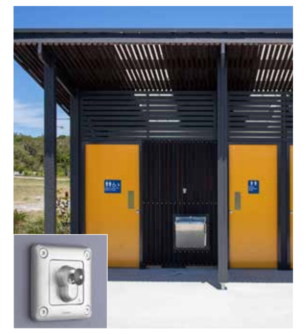
PUBLIC PARKS | Keyswitch