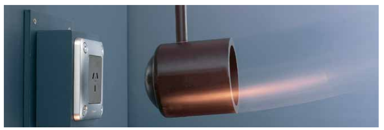
IK 10: MAXIMUM IMPACT RESISTANCE | All Soliroc products can withstand impacts of 20 joules

All Soliroc™ products have successfully undergone severe testing to ensure we can offer you maximum security.