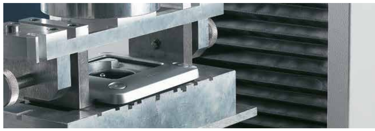
IK 10: MAXIMUM PULL-OFF RESISTANCE Rounded plate shape to prevent a firm grasp