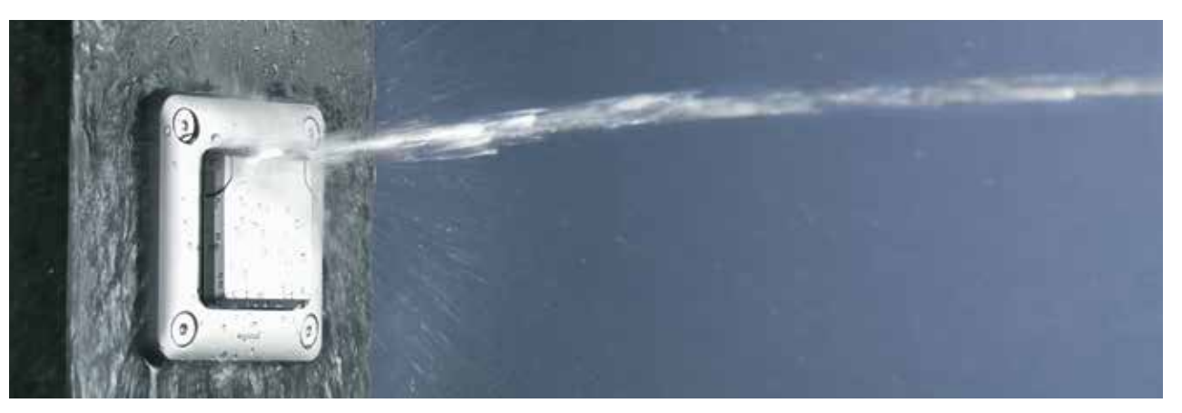
IP 55: GUARANTEED WEATHERPROOF ^{\mid} On the main functions required for outdoor installations