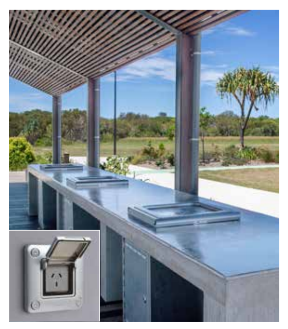
OUTDOOR AREAS | Weatherproof Powerpoints