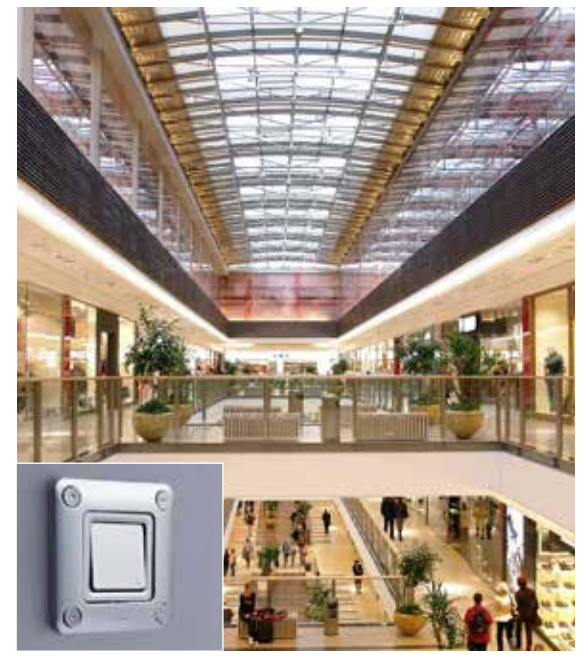
SHOPPING CENTRES | Switch