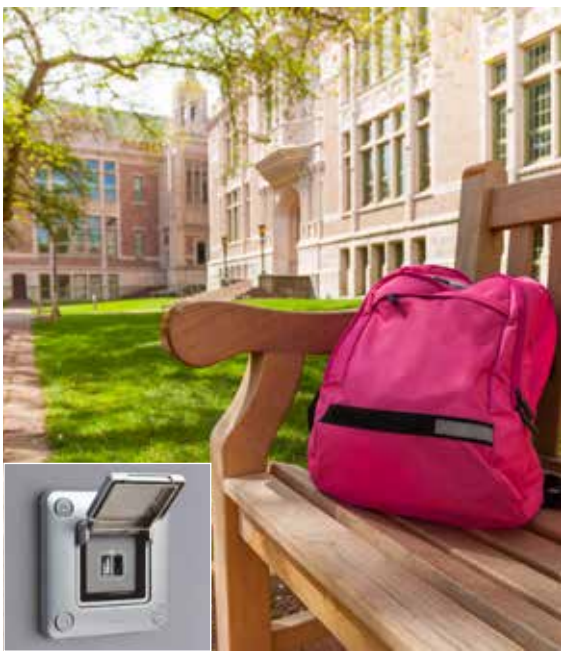
SCHOOLS | USB charger