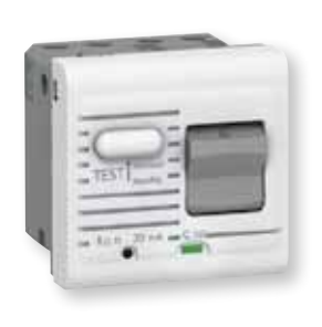
RCB0 Single pole & neutral 30mA 16A 240V