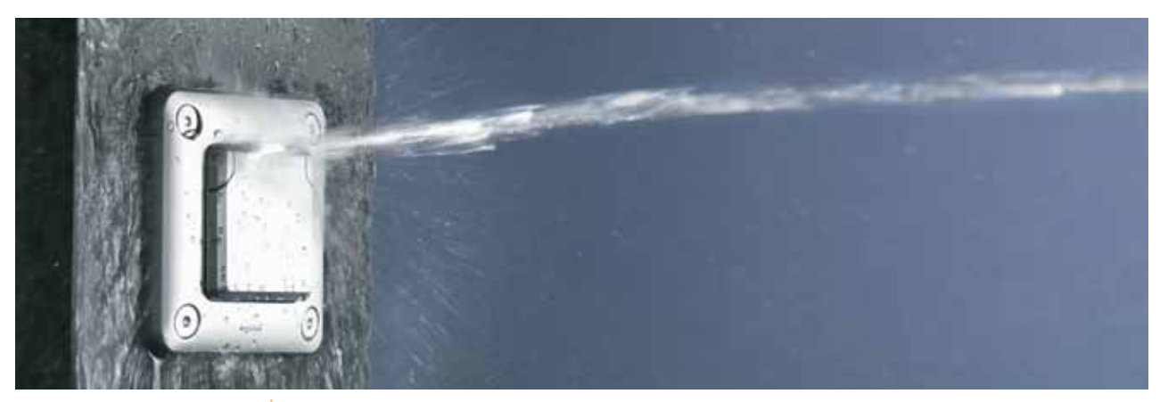
IP 55: GUARANTEED WEATHERPROOF | On the main functions required for outdoor installations