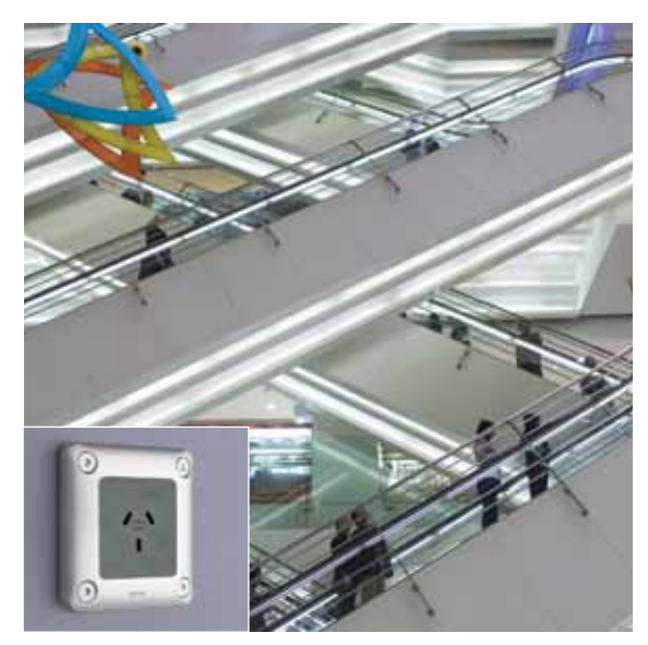
SHOPPING CENTRES | Arteor Socket