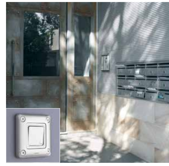
OUTDOOR AREAS | Weatherproof switch