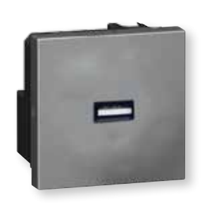
USB female socket For connecting USB devices