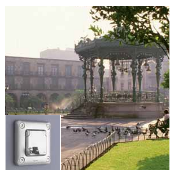
PARKS & GARDENS | Socket with locked cover