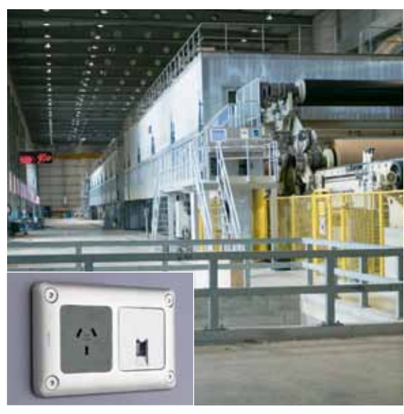
WAREHOUSES | Arteor Socket + RJ 45 network socket