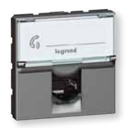
RJ sockets Cat 6, 5E & telephone