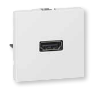
HDMI socket For digital HD audio/video connection