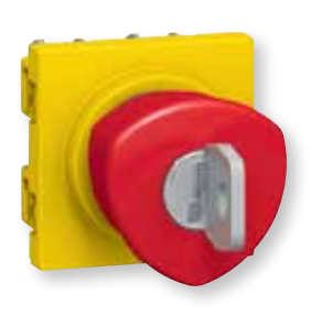
Emergency stop mushroom head push-buttons With key or 1/4 turn