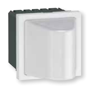
Overdoor lighting units Supplied with diffusers and LED