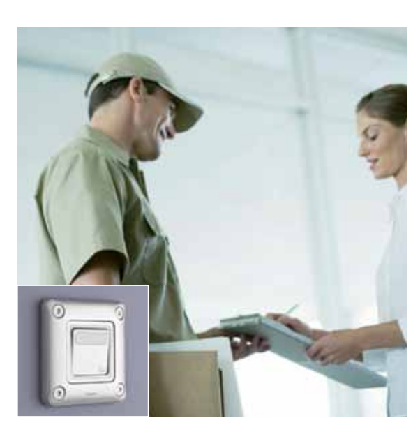
OFFICES | Pushbutton with label-holder