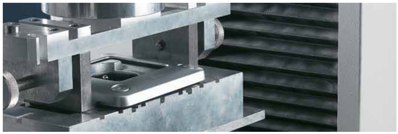
IK 10: MAXIMUM PULL-OFF RESISTANCE | Rounded plate shape to prevent a firm grasp