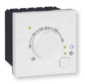
Electronic room thermostat Adjustable range from 5°C to 30°C