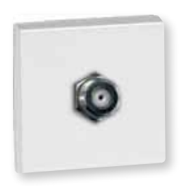
Television sockets 75 ohm "F" connector