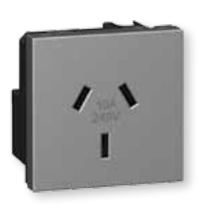
Socket outlet 240V 10A and 15A autoswitched socket

To view all the Arteor mechanisms available please see the Arteor catalogue or visit www.legrand.com.au.