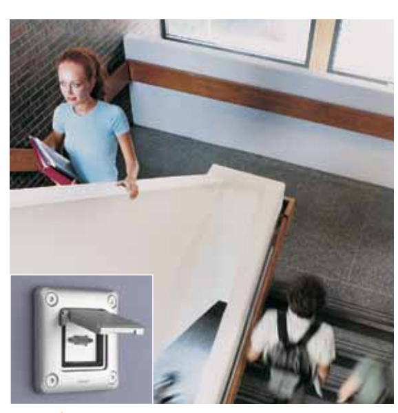
SCHOOLS | Arteor adaptor with cover