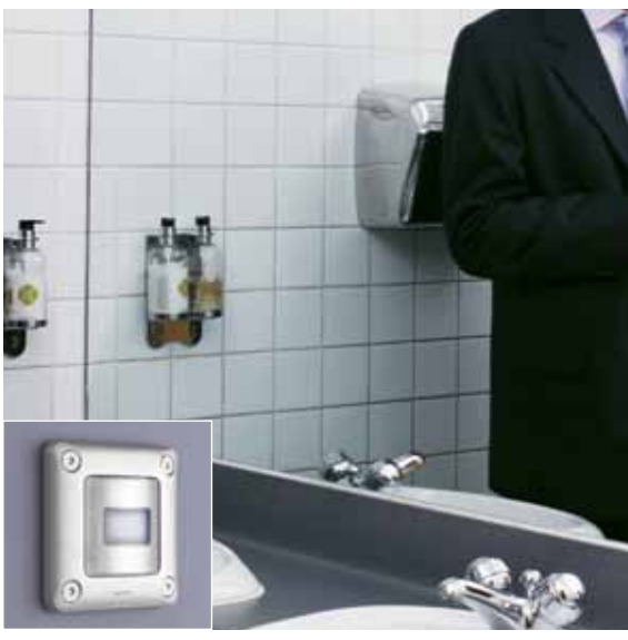
PUBLIC WASHROOMS | Automatic switch