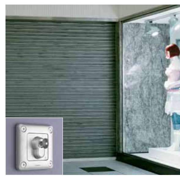
SHOP FRONTS | Keyswitch