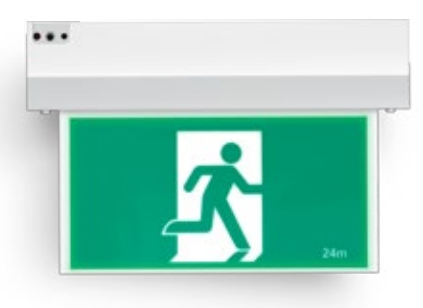
Securit tamper resistant emergency lighting

More than ever, Legrand combines safety and energy savings with our emergency lighting solutions. These safety systems are available all over the world. They comply with our environmental commitments and incorporate an eco-design approach and low maintenance.